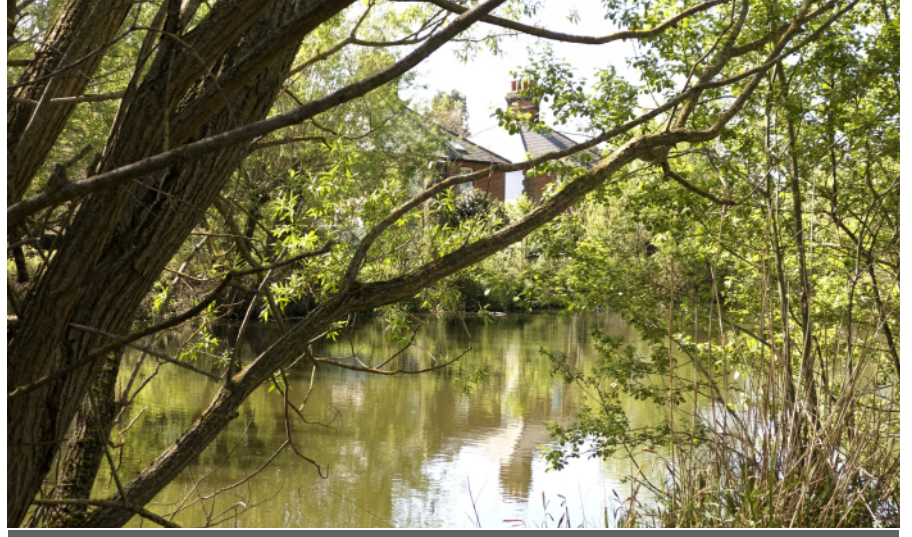
While the trees around the pond, photographed here last April, may look nice, they did considerable damage by dumping tons of leaves into the pond over the years and sucked scarce water out of the pond, particularly during the dry season. The Council has since cut back the trees and pollarded others to avoid future problems.