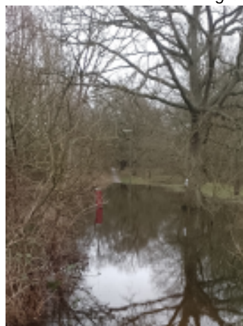
Flooding across footpath

For many years, large areas of the Woodfield near Ashtead station have been submerged in water during much of the winter. The path running alongside the station carpark has often been impassable. On advice from a respected local historian, Cllr Patricia Wiltshire located a drain covered with brambles and asked the Council to cut back the vegetation to expose it. Further investigation revealed that drains owned by Network Rail and APCOA (the carpark operator) were blocked. Thankfully, most of the water has now drained away, so we know there is a remedy and hope that flooding at Woodfield will be a thing of the past.