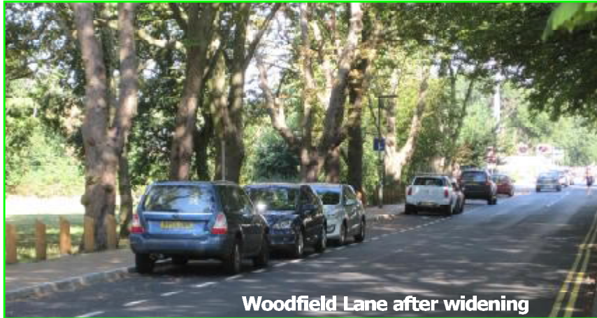
Woodfield Lane after widening

The new lay-by provides short-stay parking and, not only allows for a two-way flow of traffic for the first time, but also alleviates congestion on Craddocks Parade. The "No Right Turn" restriction preventing turning over the crossing from St Stephen's Avenue is expected in the next few weeks having had to wait the necessary legal work. The improvements have been warmly welcomed by residents.