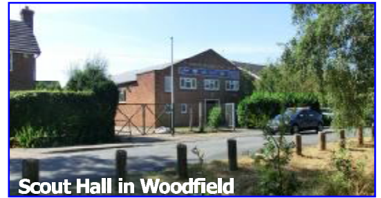
Scout Hall in Woodfield

Ashtead Independent District Councillors will be holding a drop-in surgery on the first Saturday of each month, starting on Saturday, 1st October 2016 in the Scout Hall (Woodfield). Each session will be for one hour from 12.00 mid-day to 1.00 p.m. and no appointment is necessary.