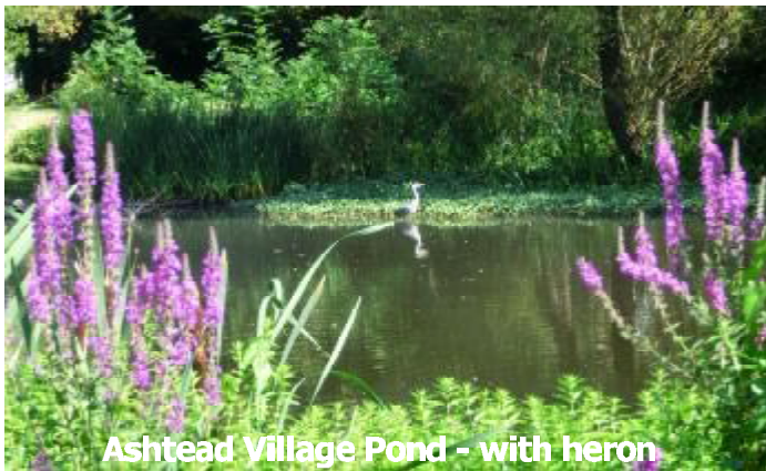
Ashtead Village Pond - with heron

The northern margins of Ashtead Pond, adjacent to Barnett Wood Lane, were becoming dominated by re-growth of previously cut willows and young ash trees. In addition to increasingly obscuring the views of the Pond from the road, this re-growth was threatening the wetland plants that had been established there.