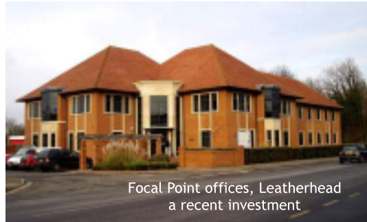
Focal Point offices, Leatherhead a recent investment

So for 2018/19, MVDC expects a funding shortfall of around £2.0m. It is hoped