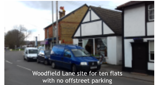
Woodfield Lane site for ten flats with no offstreet parking