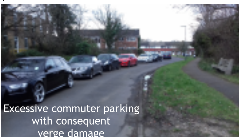
Excessive commuter parking with consequent verge damage

There are problems around all our schools at drop off and collection times. Meanwhile residents without off street parking space often struggle to find nearby parking, and there are many stories of residents stuck in their own driveways by inconsiderate parking and of delayed emergency service or delivery vehicles. The situation is only likely to get worse as new properties are still being approved with little or no off-street parking, despite the recommendations in the Ashted NDP.