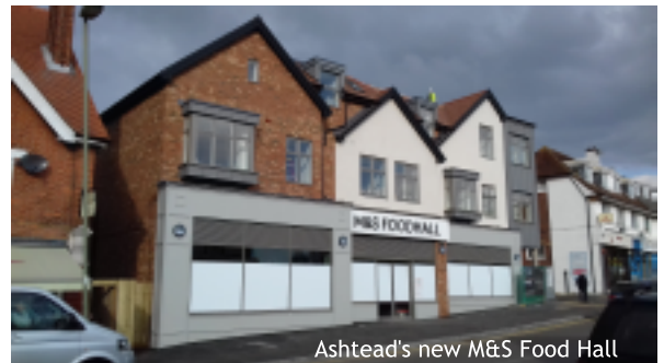
Ashted's new M&S Food Hall

It is not in the interest of Council Tax or Business Rate payers to run empty spaces. On this basis, it was decided that no precipitate action should be taken and that the situation during the early weeks of M&S trading would be monitored and then reviewed.